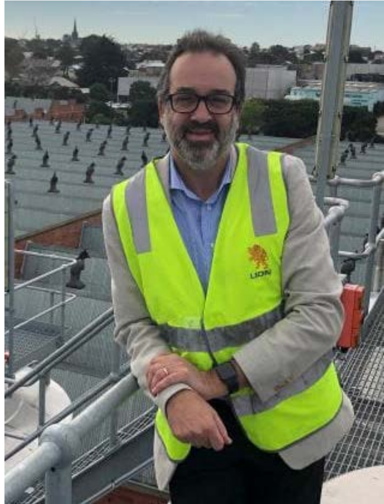
m Jobs minister Martin Pakula.