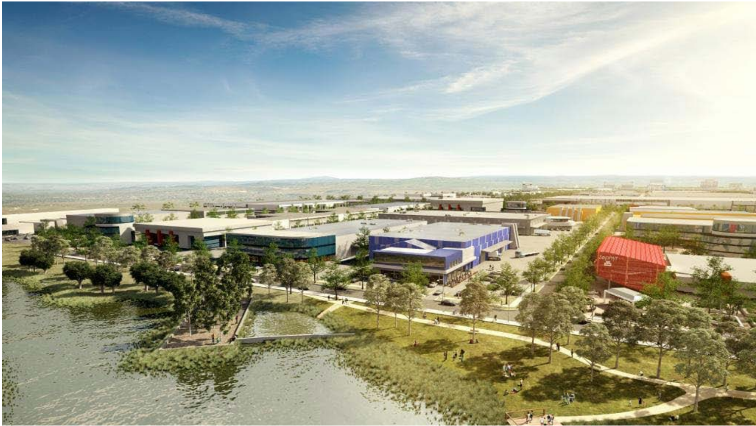
m An aerial artist impression of the new Merrifield Business Park.

Family-owned smallgoods manufacturer D'Orsogna had outgrown capacity at its Mount Waverley factory and State Government cash helped it build the new home for its cooking, smoking, cooling, storing, slicing and packaging needs on Australia's east coast.